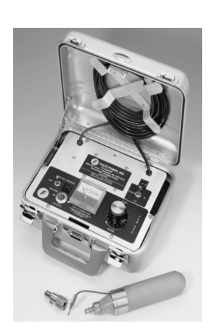
Figure 4 Gear Pump