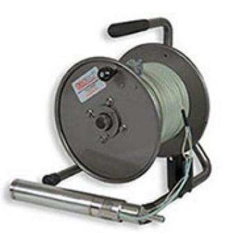
Figure 2: Submersible Pump

These pumps are light weight and versatile. To overcome potential overheating that could affect sample quality, the pumps can be provided with a cooling shroud. To avoid potential issues backflow, the pump should be provided with a check valve. In addition, to provide greater pump speed control (e.g.,