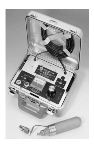
Figure 3: Gear Pump

to account for changes in pressure and torque at the impellers) and minimize potential pump flow loss, the pump controller should be equipped with a "ten turn pot" frequency adjustment knob. Some manufacturers of submersible pumps include Geotech, and Waterra.